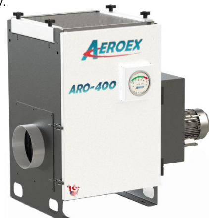
Shown, left hand suction