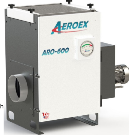
Shown, left hand suction