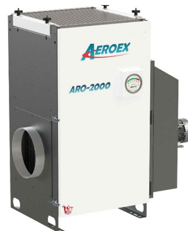
Shown, left hand suction