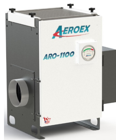
Shown, left hand suction